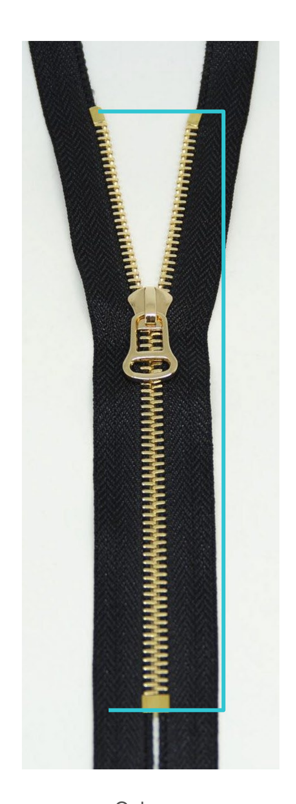
Only measure the metal teeth

When you measure a zipper, you DO NOT include the length of the tape extenders. You only measure from top stop to bottom stop for your TRUE zipper length - metal to metal.